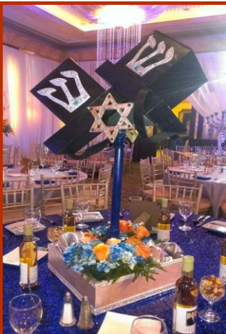
The creation of Ety Moshe

"VOLUNTEERS DO NOT NECESSARILY HAVE THE TIME;