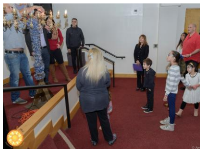
Lighting the Menorah